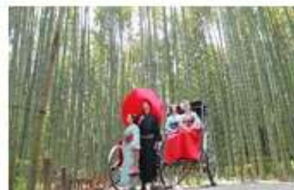
Arashiyama (Sagano bamboo forest)