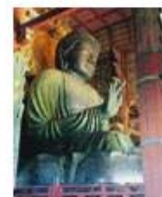
「World Heritage」 Big Buddha of Nara (Admission adult 500yen)

※Randen ride from Arashiyama to Shijo-Omiya will not be accompanied by tour conductor. Bus will be boarded at Shijo-Omiya station.