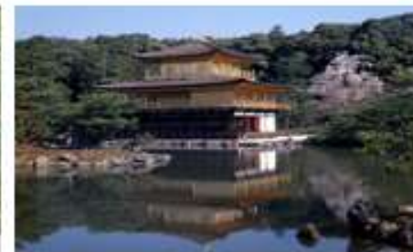
「World Heritage」Kinkaku-ji Temple (Admission adult 400yen)