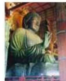
「World Heritage」 Big Buddha of Nara (Admission adult 500yen)

※Umeda to Namba by shuttle bus. (Tour bus boarded at Namba)