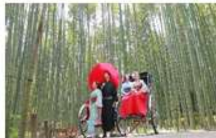
Arashiyama (Sagano bamboo forest)