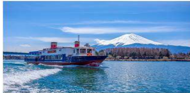
Kawaguchiko Excursion Ship "En Soleil"

※ No service on : Oct/6,7,9,10; Nov/3,4,8, Jan/2; Feb/24; Mar/16,17; May/3,4,5,6