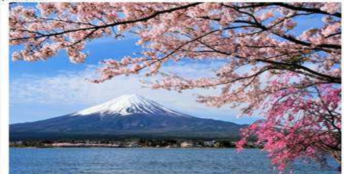
Mt. Fuji from Kawaguchiko