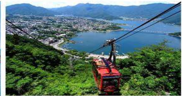
Mt. Fuji Panoramic Ropeway