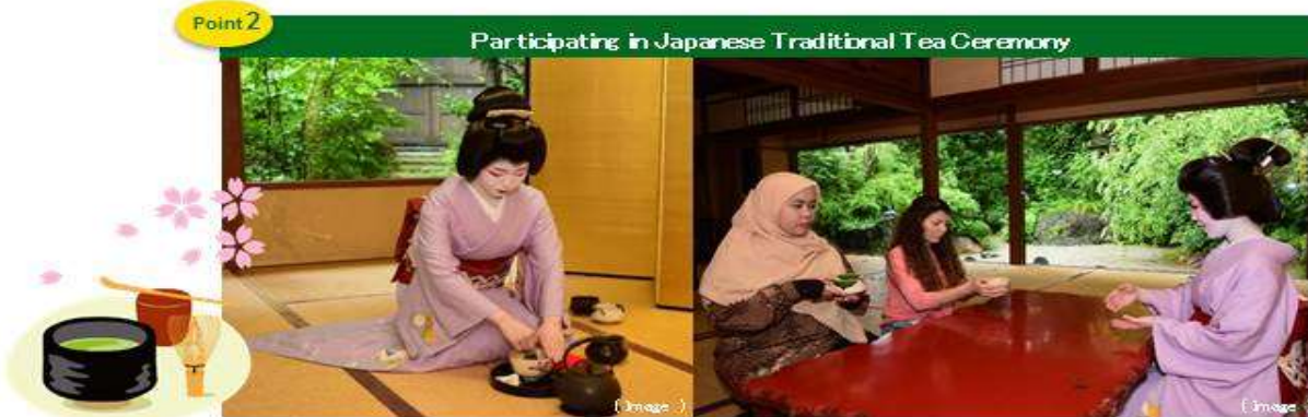
She will explain to you the tools she use to make the tea and then she will perform the tea ceremony.