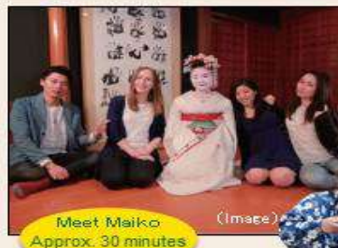
Meet Maiko Approx. 30 minutes (Image)

※ You'll be served either by Maiko or Geiko