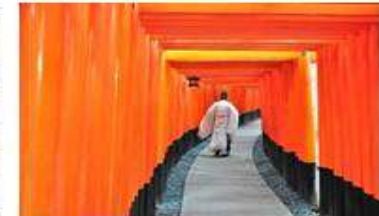
Fushimi Inari Taisha