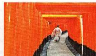
Fushimi Inari Taisha