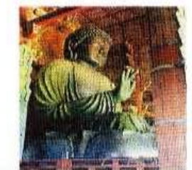
「World Heritage」 Big Buddha of Nara (Admission adult 500yen)

※Randen ride from Arashiyama to Shijo-Omiya will not be accompanied by tour conductor. Bus will be boarded at Shijo-Omiya station.