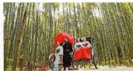
Arashiyama (Sagano bamboo forest)